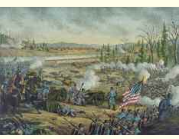
Battle of Stones River

HOOD'S CAMPAIGN Union Gen. William T. Sherman and his army occupied Atlanta, Georgia, on September 2, 1864. Having defeated Confederate Gen. John Bell Hood and the Army of Tennessee, Sherman spent several weeks resting his army and planning his next moves. When Hood began ranging northwest against Sherman's supply lines, Sherman dispatched troops to Nashville under Gen. George H. Thomas. The line became less critical to Sherman on November 15, when he began the "March to the Sea" to open more secure lines and destroy Confederate resources. Rather than pursue Sherman, on November 22, Hood moved north from Alabama to Tennessee, hoping to draw Federal attention from the Deep South and perhaps invade Kentucky. The two largest armies in the region thus marched away from each other instead of fighting. In Tennessee, however, Thomas sent Union Gen. John M. Schofield's division to delay Hood's advance at Columbia and Spring Hill before falling back to Franklin. The bloodbath there on November 30 crippled Hood's force, but the Confederates followed Schofield to the outskirts of Nashville and Thomas's strong defenses. Hood besieged the city, and more than two weeks passed before he acted. On December 15-16, the Federals sallied forth from their defenses and crushed Hood's army, effectively ending his campaign as the remnants of the Army of Tennessee fled to Tupelo, Mississippi. Some of the army then joined Gen. Joseph E. Johnston in North Carolina.